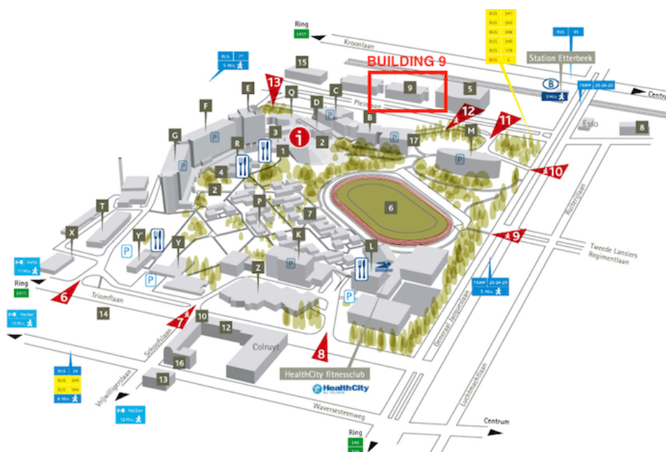
Fig. 1: Overview of the university campus. Building PL9 is highlighted by the red rectangle.

The AHG meetings during the weekend will take place at VUB-imec Offices, Pleinlaan 9, B-1050 Brussels . The main JPEG meeting is organized in buildings D and E at the Brussels Humanities, Sciences Engineering Campus campus of the Vrije Universiteit Brussel, Pleinlaan 2, B-1050 Brussels (Etterbeek) .